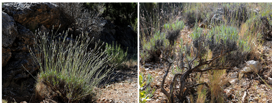
Fig. 2 Mid-aged (left) and older individuals (right) of the lavender Lavandula latifolia (Lamiaceae). These plants accumulate epigenetic mutations in their somatic tissues continuously as they grow and age, and those epimutations are passed onwards within plants via the growth of new tissue and branches. This process of epimutation and internal propagation leads to epigenetic mosaicism, which likely structures subindividual trait variability. This discovery represents a potentially important and previously underappreciated mechanism that could help plants thrive in the face of environmental variability.

Epigenetic mosaicism as a mechanism for coping with variability is so elegant it makes genetic mosaicism look clumsy in comparison. Whereas genetic mutations are essentially random with respect to the environment, epimutations are often adaptive responses to environmental cues. This difference means epigenetic mosaicism